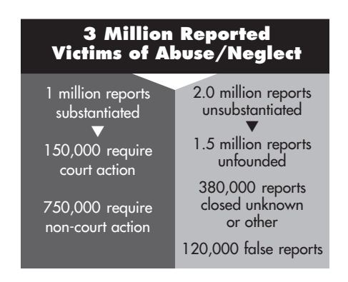
Child Maltreatment, 2000 Source: U.S. Department of Health and Human Services

Approximately three million children are reported as victims of abuse and neglect by parents or other caregivers each year. These allegations of maltreatment are investigated by the appropriate child welfare agency, and approximately one-third of reports are substantiated. Many of the children found to be maltreated enter the foster care system, and approximately 15 percent of the victims require court action of some sort.