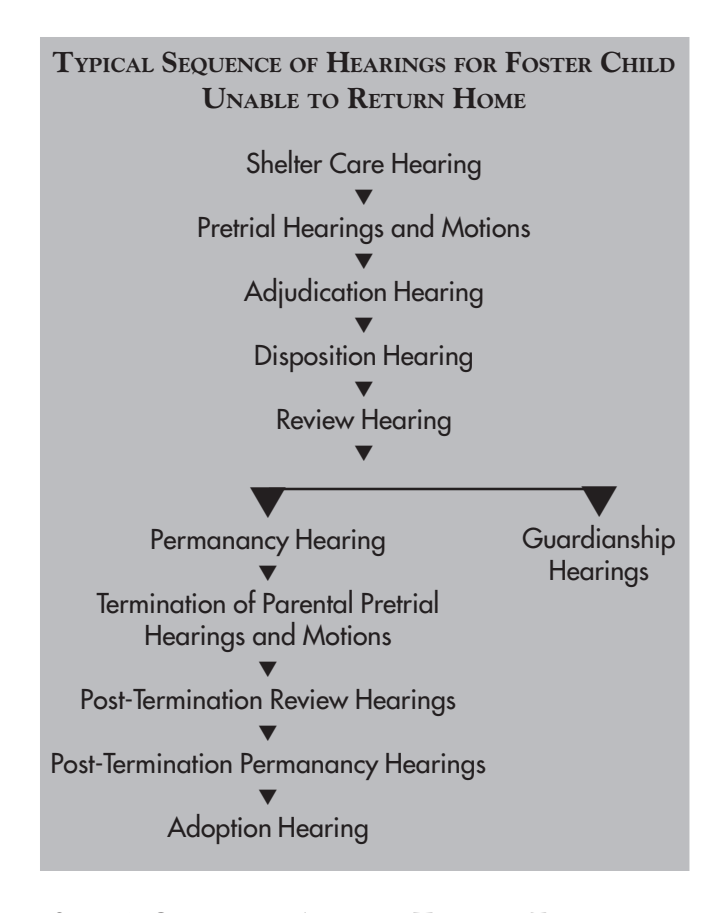
STEP 4: CALCULATE AVERAGE TIME PER EVENT

After selecting the particular events to be included in the workload assessment, the next step is to determine the average time spent on each event type. This can be done with an actual time study or with estimates derived from a panel of judges working iteratively. We recommend a